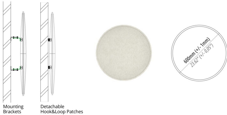
Mounting Brackets Detachable Hook&Loop Patches